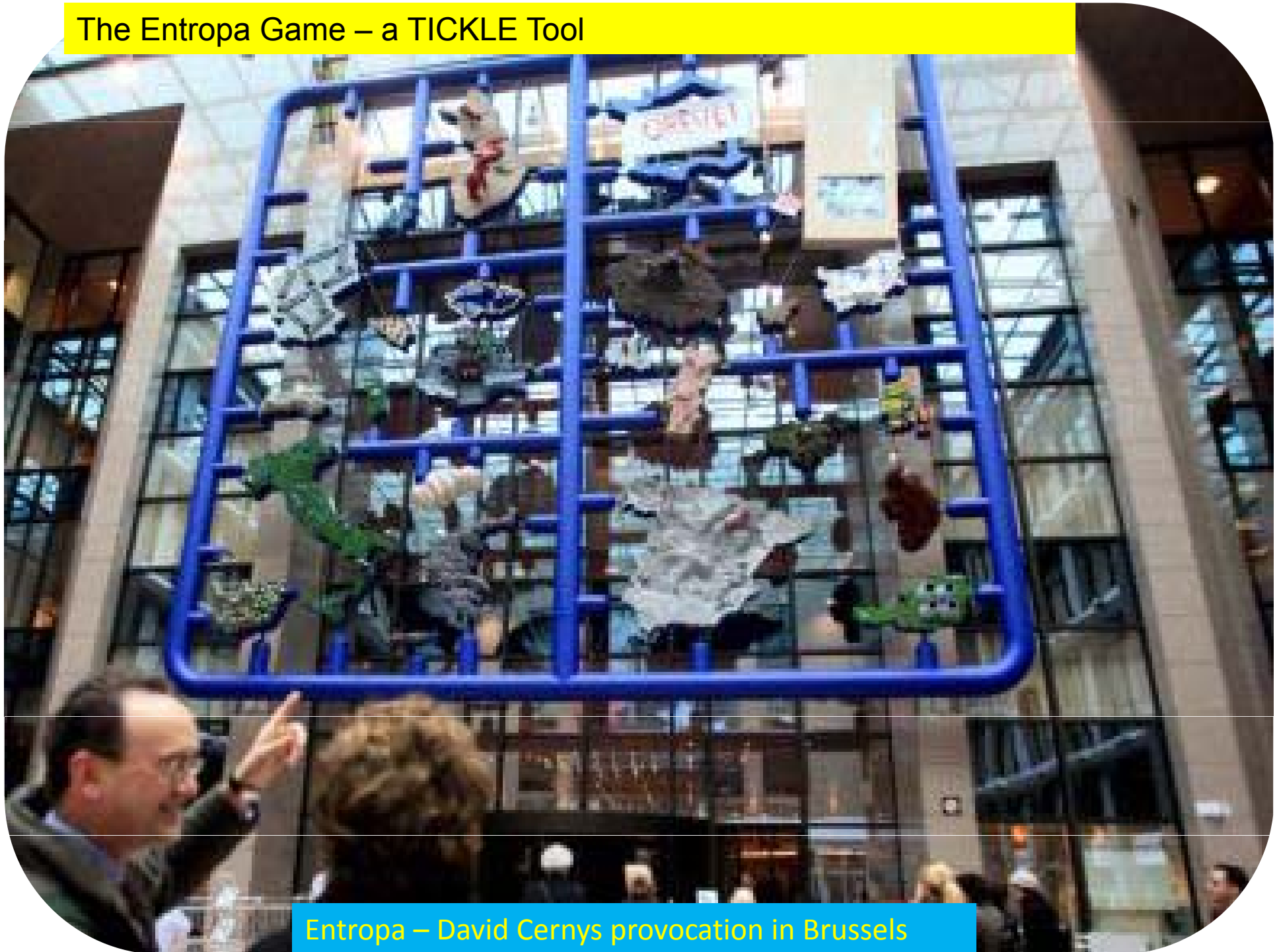
Entropa – David Cernys provocation in Brussels