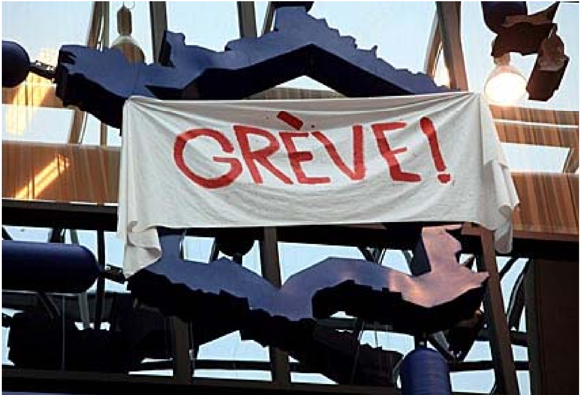
Entropa – France on permanent strike